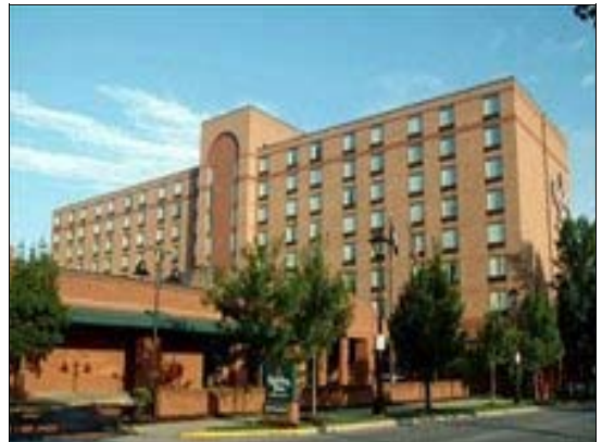
Holiday Inn Select in downtown Lynchburg provides a first class conference site.